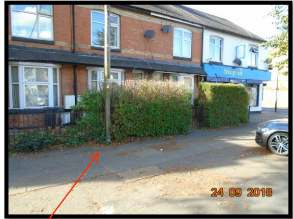
Before and after shots following legal notices served on properties/land in the ward